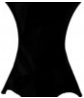
Table Covers (additional cost to table) Stock colours black, white, blue or lime green – other colours available on request