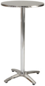
Tall Aluminium table