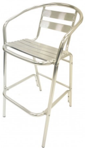
Aluminium bar stool